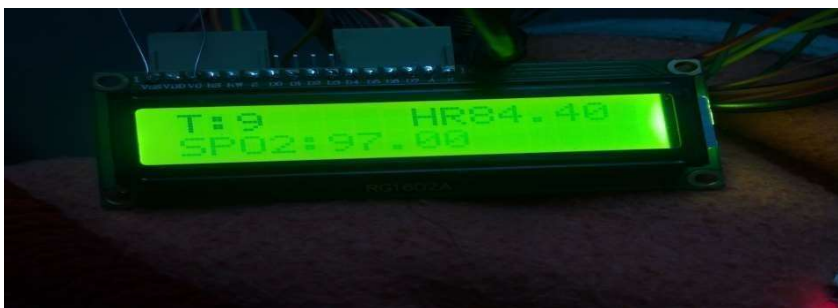
Picture1.Display of data

The final result of the system is we get a person's heart rate, body temperature and oxygen level on the display. A sixteen by two display is used to show the data, on that digital reading are displayed so anyone can easily detect and read the parameters. By checking the readings of parameters one can detect patients health But, if the readings are not in normal range then a person can immediately visit to the doctor. As shown in picture 1 three parameters are displayed where T is temperature, HR is heart rate and SPO2 is the oxygen level.